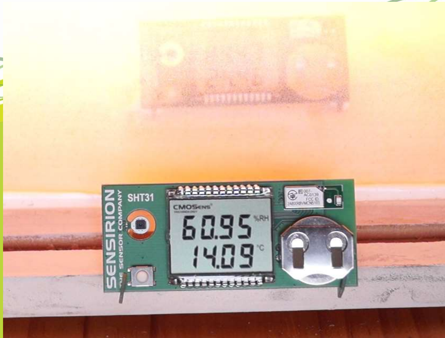
Double glazed acrylic unit – 20 mins into test