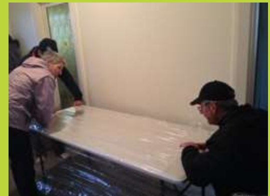
The Valley Project's Cosy Homes Initiative